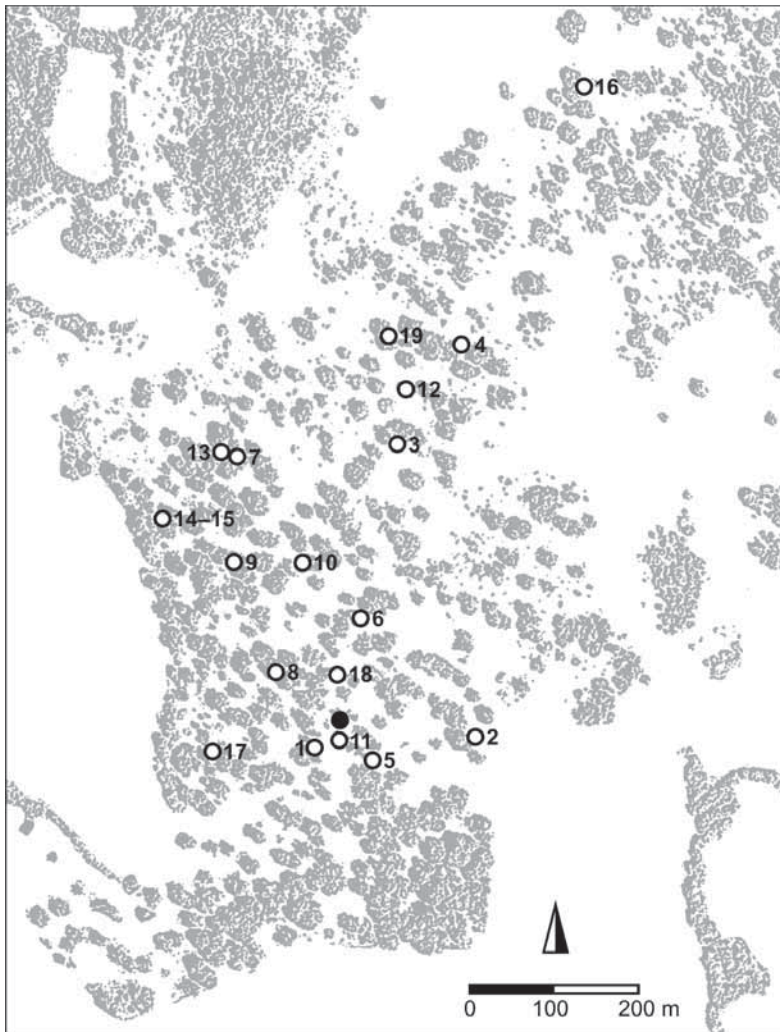
Fig. 2. Study area of pastured oak woodland in the Gavurky Protected Area (grey – trees canopy, circles – tree-hollows of bats, black dot – mist-netting water pit).

(Fig. 2). The bats were usually mist-netted (nets 7–14 m in length) up to midnight. Altogether 61 day visits (including 28 mist-netting sessions) were conducted in the area. Since 2003 all caught individuals (with some exceptions) were banded using incoloy chiropterological rings. Most occupied tree roosts were found before sunrise, as bats swarmed round the tree before they entered the hollows or during the day by listening to vocal calls that roosting bats made (for details of methods see Kaňuch 2005, 2007). The location of roosts of Myotis bechsteini (in 2007) was done using radio-telemetry equipment (Kaňuch et al. in prep.). During the survey we also sporadically used ultrasound bat-detectors (Pettersson D200, D240x). Frequency of occurrence (F) and species dominance (d) were used for analysis of the assemblage structure.