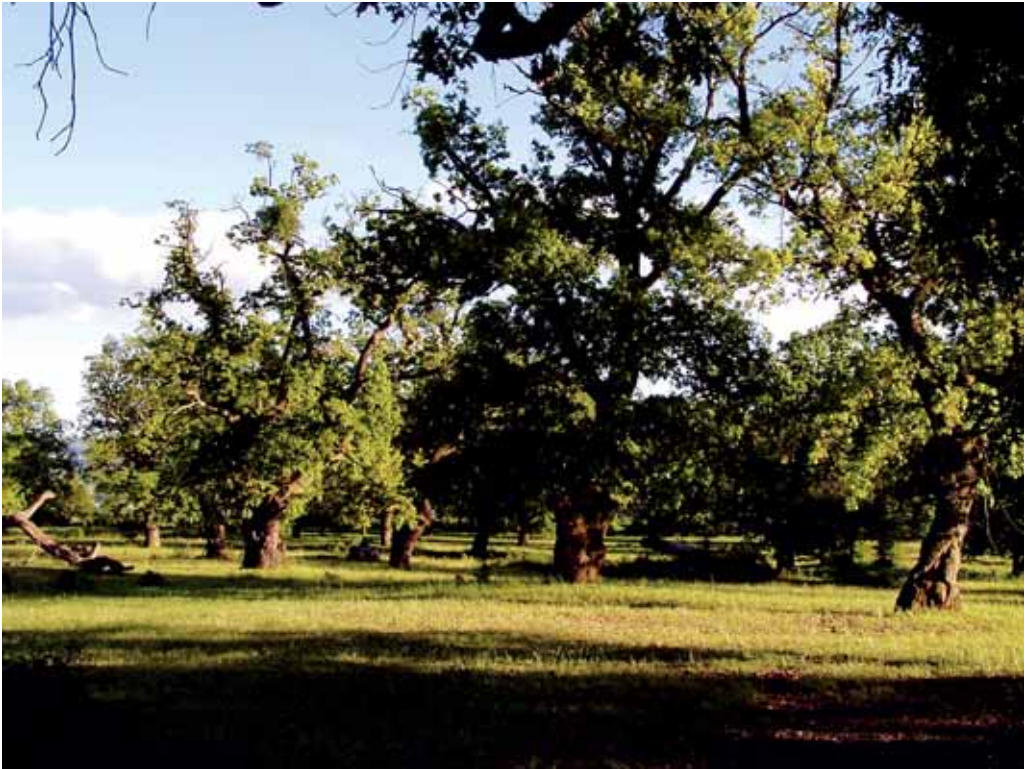
Fig. 1. Old oaks (mainly Quercus robur ) in the Gavrurky Protected Area (Pliešovská kotlina Basin, central Slovakia) provide plenty of natural roosts for bats (photo by P. Kaňuch).

Obr. 1. Staré duby (hlavne Quercus robur ) v Chránenom areály Gavrurky (Pliešovská kotlina, stredné Slovensko) poskytujú množstvo prirodzených úkrytov pre netopiere (foto P. Kaňuch).