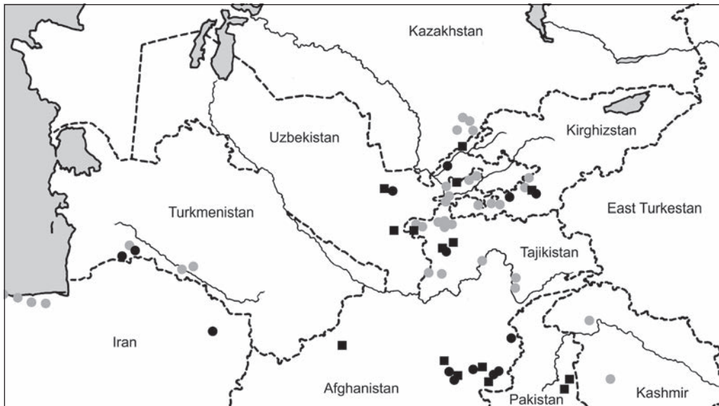
Fig. 3. Records of small-sized representatives of the genus Rhinolophus in Central Asia. Explanations: grey dots = published records referred to Rhinolophus hipposideros ; black squares = records of R. lepidus ; black dots = revised records of R. hipposideros . Based on the data by Bogdanov (1953a, 1968), Topál (1974), Strelkov et al. (1978), Rybin et al. (1989), Habilov (1992), Roberts (1997), Šajmardanov (2001), Ghosh (2008), Benda et al. (2012), Nadeem et al. (2013), Benda & Gaisler (2015), Habilov & Tadžibaeva (2016), and new data. In some cases, one symbol represents more than one site.

Obr. 3. Nálezny malých zástupců rodu Rhinolophus ve střední Asii. Vysvětlivky: šedivé kroužky = nálezny publikované pod jménem Rhinolophus hipposideros ; černé čtverce = nálezny R. lepidus ; černé kroužky = revidované nálezny R. hipposideros . Založeno na údajích Bogdanova (1953a, 1968), Topála (1974), Strelkova et al. (1978), Rybina et al. (1989), Habilova (1992), Robertse (1997), Šajmardanova (2001), Ghoshe (2008), Bendy et al. (2012), Nadeema et al. (2013), Bendy & Gaislera (2015), Habilova & Tadžibaevy (2016) a na nových údajích. V některých případech zahrnuje jeden symbol více než jednu lokalitu.