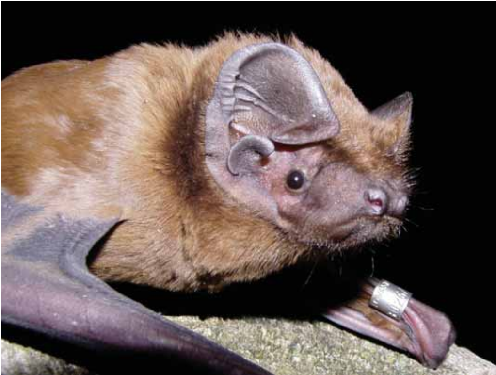
Fig. 2. Recaptured subadult male of the Nyctalus lasiopterus on 21 September 2005, Za Havraník, central Slovakia.

noctules (Dobrosi 1993, Gombkötő et al. 1996, Czájlik & Harnos 1997, Bihari et al. 2000, Matis et al. 2003). Some of these records could indicate the existence of a reproductive population of N. lasiopterus in the region. In the period 1993–2003, tens of individuals, nursing and/or lactating females included, during the breeding season (June–August) were recorded there. An evidence of one tree-hollow roost was also reported (Czájlik & Harnos 1997). All these data originate from the mountain regions (Mátra Mts, Zemplény Mts, Bükk Mts) in proximity to the territory of southern Slovakia. It is interesting, that in southern Slovakian regions (e.g. Slovenský kras Mts, Slanské vrchy Mts, Cerová vrchovina Mts, Východoslovenská rovina Lowland) only one greater noctule was recorded (Matis et al. 2003), despite the fact that extensive bat surveys were conducted here (e.g. Danko et al. 2000, Matis et al. 2002, own unpublished data). The last observations could indicate that central Slovakian bats can belong to a separate breeding population. Alternatively, the area represents only the migrating or mating part of the species distribution range. The period in which the records were collected, i.e. the second half of summer, could also support the original interpretation of the occurrence of N. lasiopterus in Slovakia, i.e. as the migratory vagrants (Danko 1975, Hanák & Danko 1975).